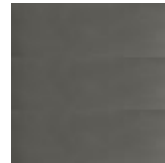
OP0 transparent varnished